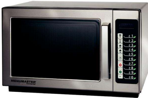
Model RCS511TS shown